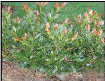
Symptoms of winter desiccation on cherrylaurel in the springtime.

Evergreens continue to lose water through their leaves during the winter, and at higher rates when exposed to sun and wind. Roots cannot replenish water when the ground is frozen and leaves desiccate as a result of this